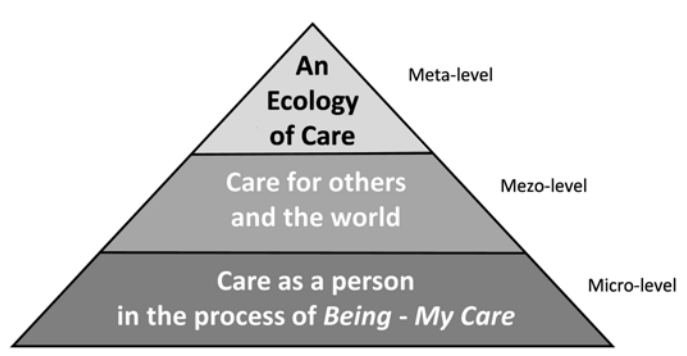
Figure 2. Levels of Care

Caring for self and others is always done in the world. This care for persons cannot be divorced from care for the world. ...being-in-the-world, signifies that being and world are integrally related" (Bishop 1991 p.62)